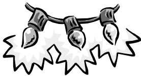
The BID lights up the night with new holiday decorations

Under the guidance of this Committee, the BID and the Glen Cove Beautification Commission are investigating the replacement of the downtown planters with new, hardier and longer lasting plantings.