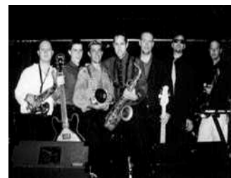
“Jazz in the Square” broke the barrier in the year 2000!

Since the ultimate goal of these events is to draw people into the downtown, we can most definitely be assured that in the year 2000, the BID maintained a very strong upward trend in numbers!